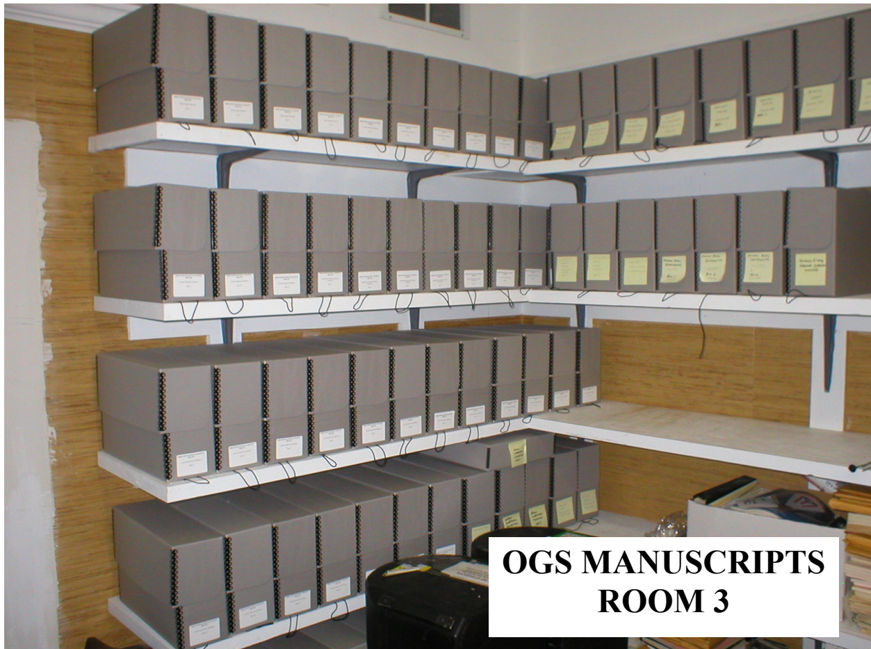
OGS MANUSCRIPTS ROOM 3

Continued modifications of the OGS Conference Manual were made to assist all future Conference chairs and committees of duties and timetables.