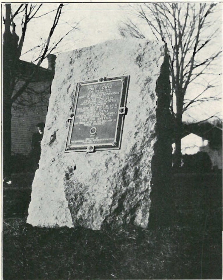
FORT GOWER, THE SECOND PLACE OF IMPORTANCE THAT WAS MARKED BY D. A. R., NOVEMBER 10, 1923, IS LOCATED AT THE CONFLUENCE OF THE HOCKING AND OHIO RIVERS AT HOCKINGPORT, ATHENS CO., OHIO. IT WAS AT THIS SPOT IN 1776 THAT A DECLARATION OF INDEPENDENCE WAS MADE BY THE PIONEERS, ALMOST TWO YEARS BEFORE JULY 4, 1776. THUS GIVING OHIO A CLAIM TO A PART IN THE UTTERANCES OF THE PIONEERS FOR INDEPENDENCE.