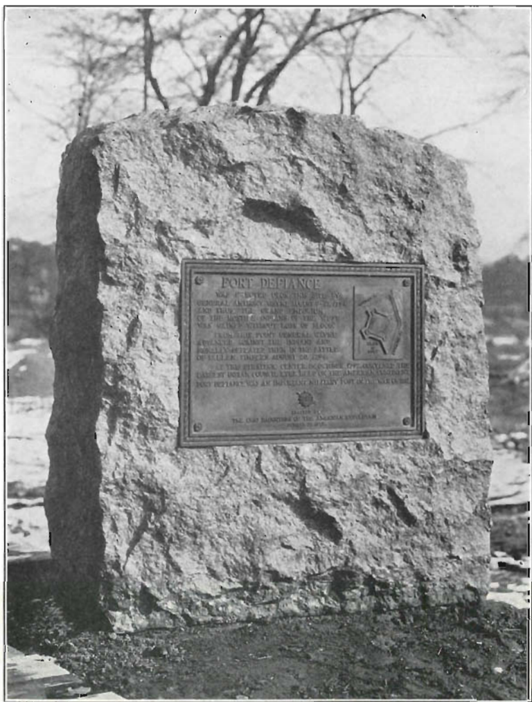
THIRD MEMORIAL. ERECTED BY OHIO D. A. R. INSCRIPTION: FORT DEFIANCE WAS ERECTED UPON THIS SITE BY GEN. ANTHONY WAYNE, AUG. 9-17, 1794 AND THUS THE GRAND EMPORIUM OF THE HOSTILE INDIANS OF THE WEST WAS GAINED WITHOUT LOSS OF BLOOD. FROM THIS POINT GEN. WAYNE ADVANCED AGAINST THE INDIANS AND DEFEATED THEM IN THE BATTLE OF FALLEN TIMBERS, AUG. 20, 1794. AT THIS STRATEGIC CENTER IN OCTOBER, 1792, CONVENED THE LARGEST INDIAN COUNCIL EVER HELD ON THE AMERICAN CONTINENT. FORT DEFIANCE WAS AN IMPORTANT MILITARY POST IN THE WAR OF 1812.