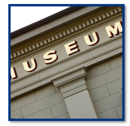
Introduce first three statewide trails