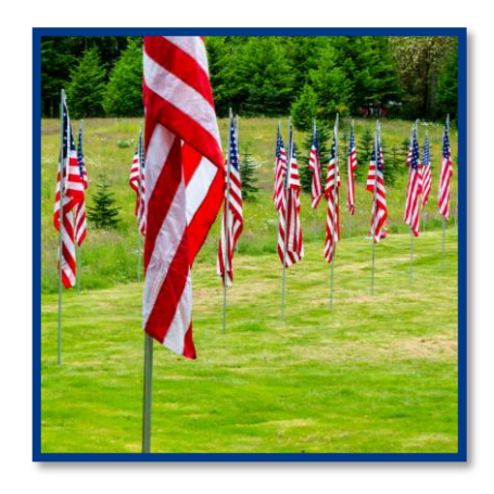
Revolutionary War Veterans grave markers