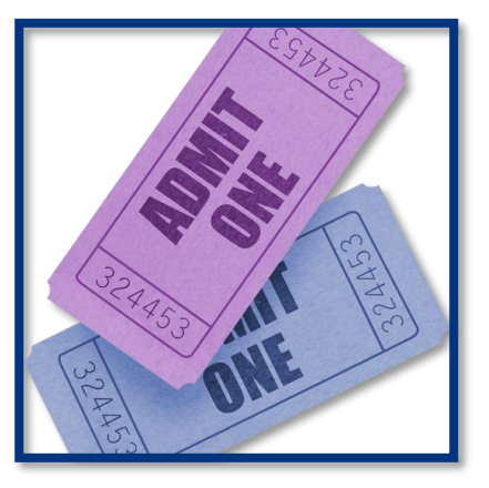
4<sup>th</sup> Grade History Pass